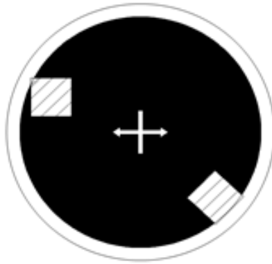
Figure 1: Example Robot placement